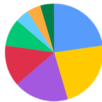
Students by School

Our 2024 event has over 50 individuals and 23 reps signed up as of 9/1/2024.